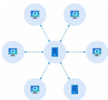
HUB AND SPOKE

With Resilio, every endpoint becomes part of a peer-to-peer fabric, eliminating bottlenecks and single points of failure, reducing costs by eliminating redundant systems, and ensuring continuous, VPN-less file-based data accessibility across your enterprise—in the office or remote. Learn more →