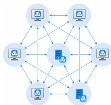
PEER TO PEER