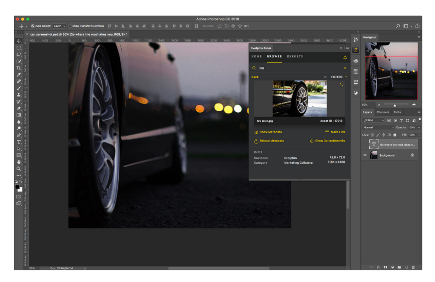
Evolphin Zoom panel for Adobe Photoshop